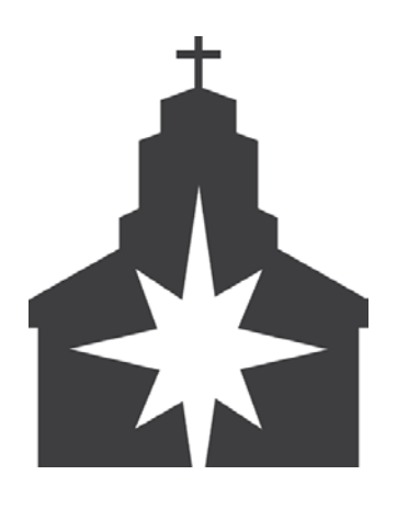
Catholic Diocese of Dallas www.cathdal.org/lightison

The Sacrament of Reconciliation is the story of God's love that never turns away from us.